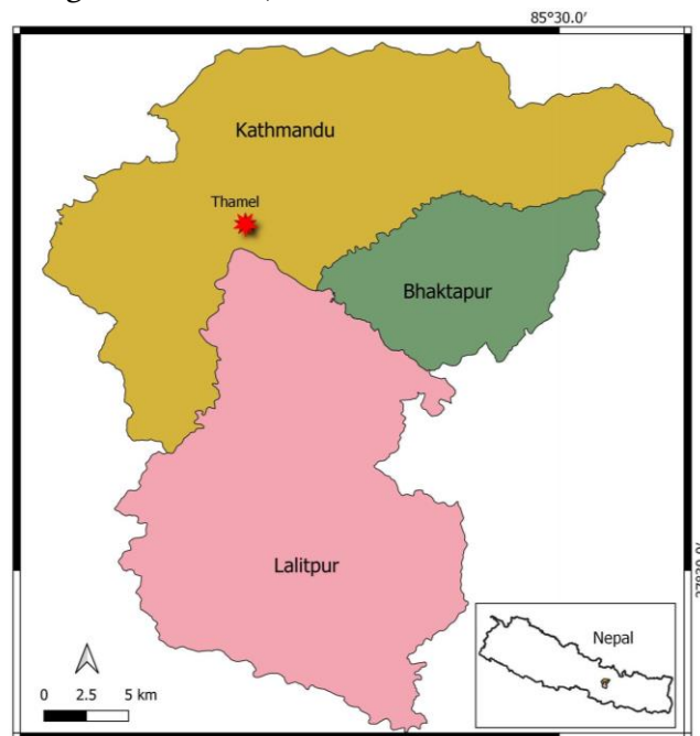
Figure 1: Study area map

The study area for this research is Thamel from the Kathmandu district of Nepal (Figure 1). Since Thamel represents many tourism destinations of Nepal because of the mass tourists' attraction, conducting this study in Thamel provides a good reflection of Nepal's tourism security. To study tourism security in Nepal, Thamel appears an appropriate place considering the flow of tourists and being a tourist-hub, which attracts almost all the tourists who visit Nepal.